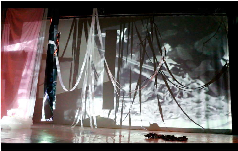
Figure 4. Augmented reality/digital forest. 'Constructing Realities' workshop. CNDP Bucharest, 2018 © DAP-Lab.