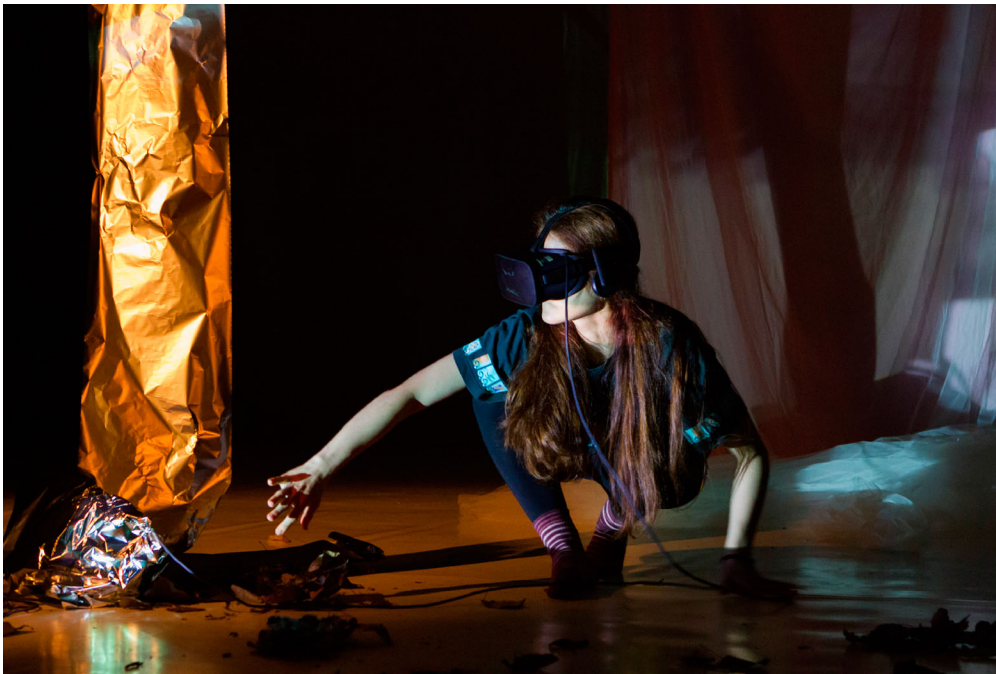
Figure 5. Visitor touching branch in virtual forest, inside augmented reality space where the sound of the suspended silver foil creates a rustling (of leaves). CNDP Bucharest, 2018 © DAP-Lab.